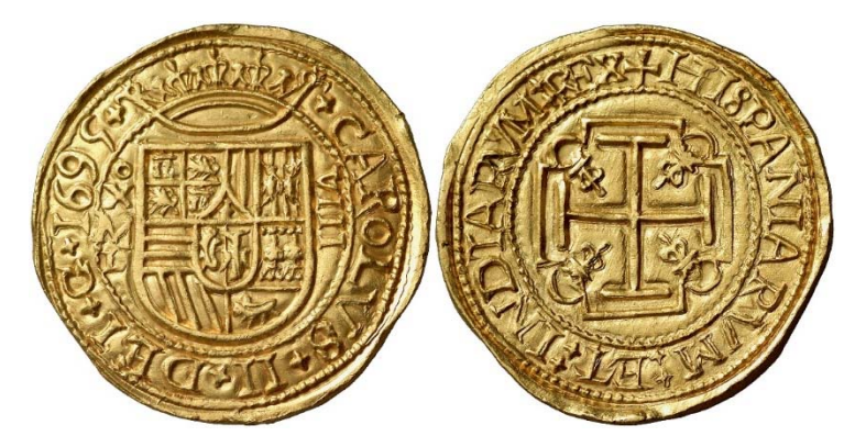
México, Charles II, 8 escudos 1695 L Aureo & Calicó subasta Caballero de las Indias April 8, 2009 lot 328. Ex. Henry Christensen Oct. 8, 1964 lot 196.

An illustration will help to illustrate the difference between standard production cobs and galanos which are high quality special coins, i.e., the so-called "royals." Even to the casual observer there is a marked distinction between these types. To be clear, the term galano so far is limited to Potosi mint records wherein it applies to the high quality blank planchets. Until such time as an equivalent term is uncovered for Lima and Mexico it serves as most correct for them too.