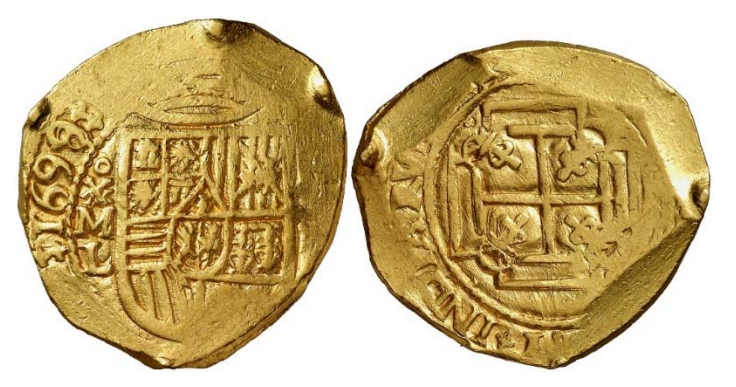
México, Charles II, 8 escudos 1699/8/7 L Aureo & Calicó subasta Caballero de las Yndias April 8, 2009 lot 329. Ex. Henry Christensen Oct. 8, 1964 lot 202.

[As mentioned in the second paragraph of this article all of the coins should have been high quality round pieces as was the case when each mint opened— Ed .].