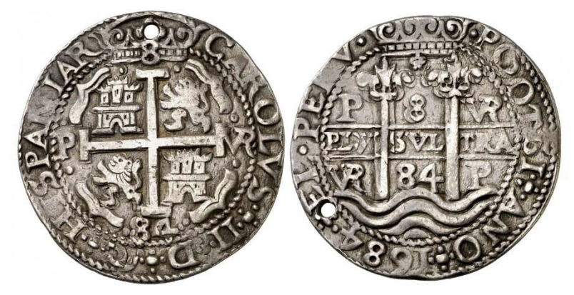
Potosí, Charles II, 8 reales 1684 VR, 26 g Aureo & Calicó subasta Dec 14, 2017 lot 404