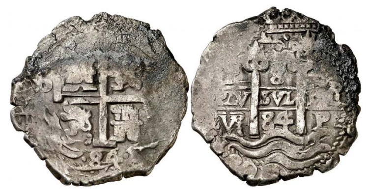
Potosí, Charles II, 8 reales 1684 VR 28.8 g fire damage (standard production) Aureo & Calicó subasta Dec 14, 2017 lot 402

(From what is visible, even though the coin is damaged from a fire, to the writer it seems the same quality dies were used for both of these Potosi specimens. The round specimen shows the mint as POOTSI.)